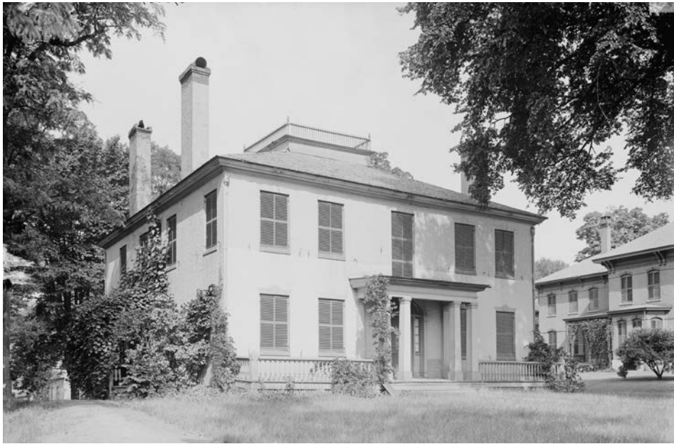
Hetty Green's residence in Bellows Falls, VT, circa 1900–1910.

also a caretaker. There are countless stories of her caring for sick neighbors, and she also played the role of Good Samaritan to complete strangers. For example, while residing in London, she bandaged a delivery man who had fallen from his carriage, while onlookers seemed content to watch him bleed out. When asked why she was viewed as a miser, she responded: