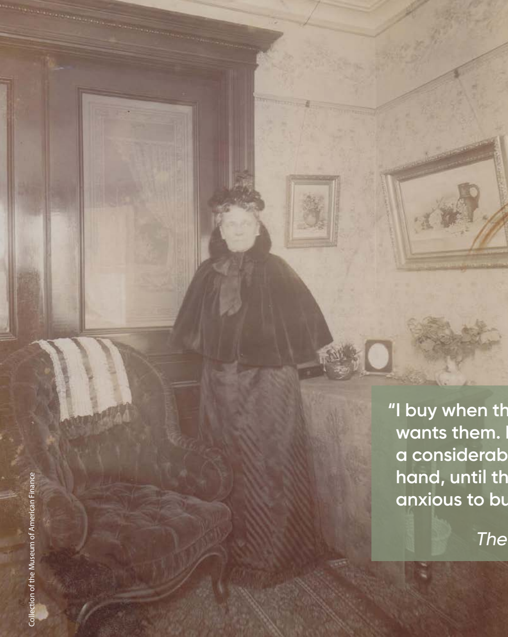
Collection of the Museum of American Finance