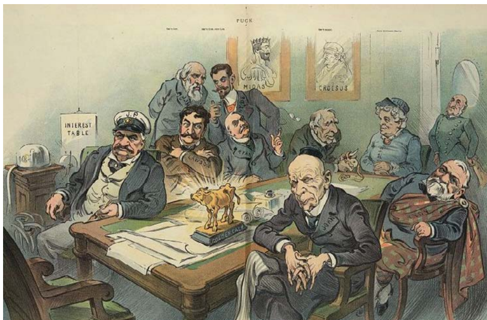
"A Cabinet That Can Afford It" illustration from the July 26, 1905 issue of Puck magazine. Hetty Green is depicted at the head of the table alongside other turn-of-the-century moguls and financiers including J. P. Morgan, Andrew Carnegie, Russell Sage and John D. Rockefeller.

To this day, ego and debt torment even the most brilliant financial minds in America. The collapse of over-extended financial enterprises and implosion of overly acquisitive businesses are often seeded by a deadly combination of inflated egos and excessive use of debt to fuel them.