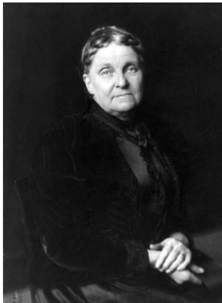
Portrait of Hetty Green, dated 1897.

Thrift is a powerful weapon for investors. Those who practice it experience little fear during financial panics because they know they can live comfortably on almost no income. High society women mocked Hetty's aversion to luxuries, yet many wished they had adopted her habits when they were forced to sell their possessions during financial panics. On such occasions, Green was among the few individuals with spare cash. For this reason, investors, companies and even city governments relied on her as a lender of last resort during hard times.